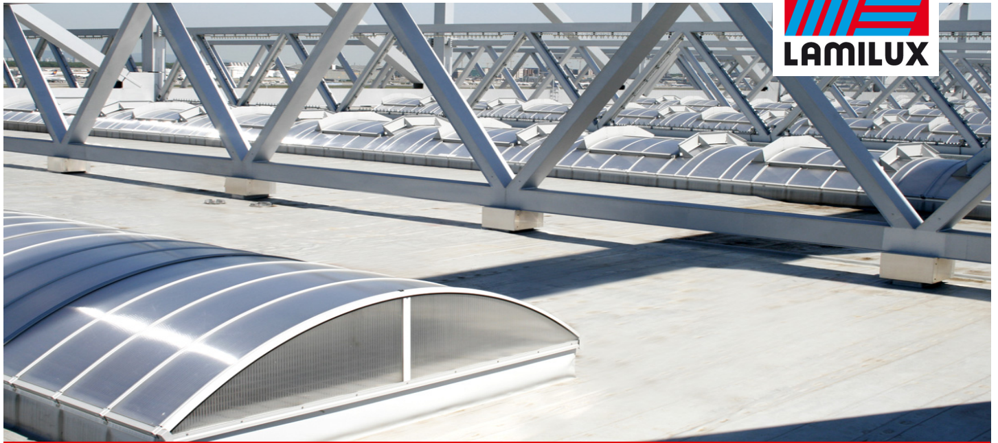
A380 Assembly Hangar