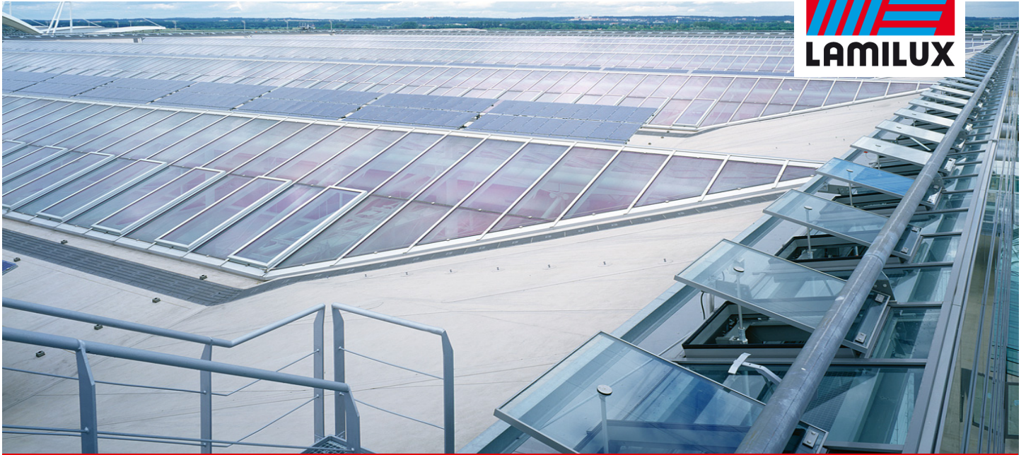
Terminal 2, Munich